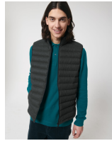
Stanley Climber Wool-Like

Shell : Plain Weave Brushed , 100% Polyester - Recycled , Fluorine-free DWR , 140 GSM