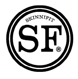
SF525 UNISEX SLIM SWEAT