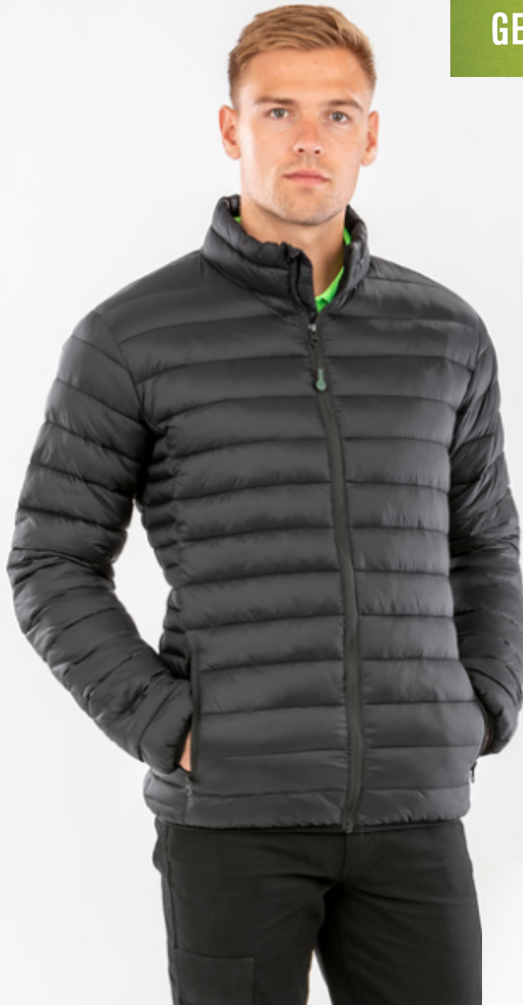
R912X RECYCLED PADDED JACKET